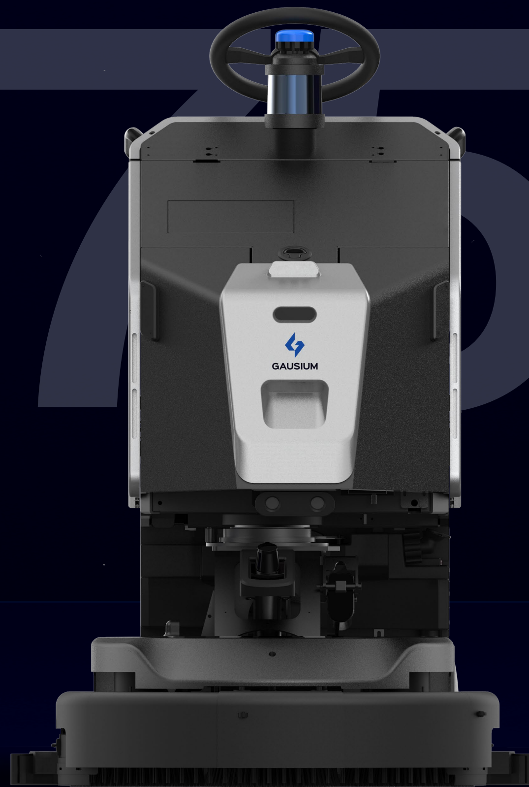
Scrubber 75 / Parking Heavy-duty Cleaning with Best-in-class Sensing